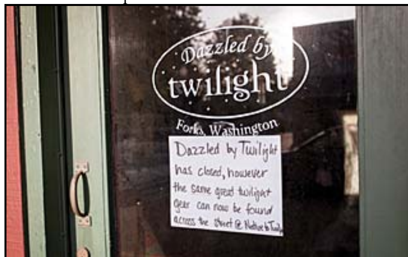
[Internet-posted image segment (enhanced), ©unknown]

On January 22nd, 2012, Forks residents and visitors alike were stunned to discover that both the Dazzled by Twilight stores in Forks had been closed. No explanation was ever offered. And, although the DBT website continued to operate for a few more months, it did little more than generate additional Better Business Bureau complaints.