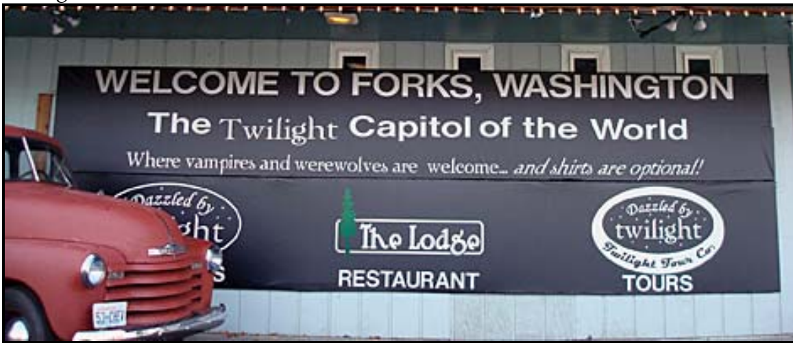
[Internet-posted image segment (enhanced), ]