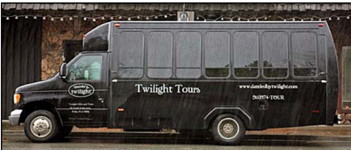
[Internet-posted image segment (enhanced), ]