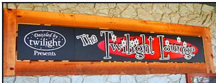
[Internet-posted image segment (enhanced), ]