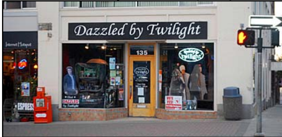
[Port Angeles DBT, ©2010 PietrosMomma]

On November 1st, 2008, Annette opened the original Dazzled by Twilight (DBT) store at 61 North Forks Avenue. Soon after that, she took over operation of the Twilight Bus Tour previously run by the Forks Chamber of Commerce, christening it the, " Dazzled by Twilight Tour Company. "